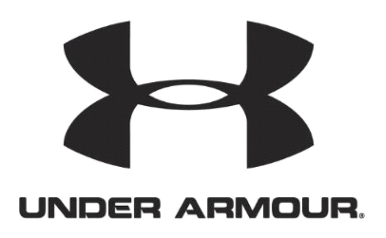
Photo - <a href="http://photos.prnewswire.com/prnh/20161102/435489">http://photos.prnewswire.com/prnh/20161102/435489</a> Photo - <a href="http://photos.prnewswire.com/prnh/20161102/435491">http://photos.prnewswire.com/prnh/20161102/435499</a> Logo - <a href="http://photos.prnewswire.com/prnh/20110127/NE37387LOGO">http://photos.prnewswire.com/prnh/20110127/NE37387LOGO</a>

To view the original version on PR Newswire, visit: <a href="http://www.prnewswire.com/news-releases/under-armour-expands-to-bostons-back-bay-with-its-largest-brand-house-opening-of-2016-300356119.html">http://www.prnewswire.com/news-releases/under-armour-expands-to-bostons-back-bay-with-its-largest-brand-house-opening-of-2016-300356119.html</a>